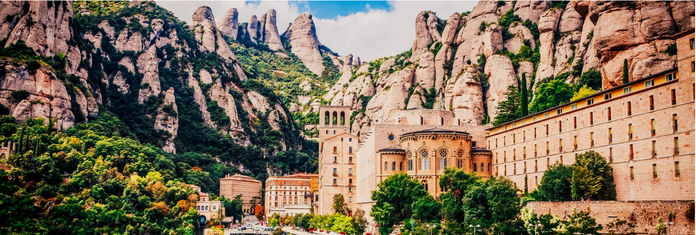
Clockwise\ from\ Left\ to\ Right:\ Fatima\sim Sagrada\ Familia;\ Barcelona\sim Archabbey\ of\ Montserrat