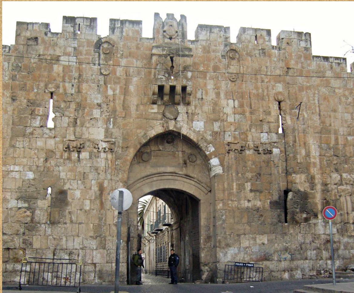
Lions' Gate, Jerusalem, https://www.gpsmycity.com/attractions/lions-gate-21250.html