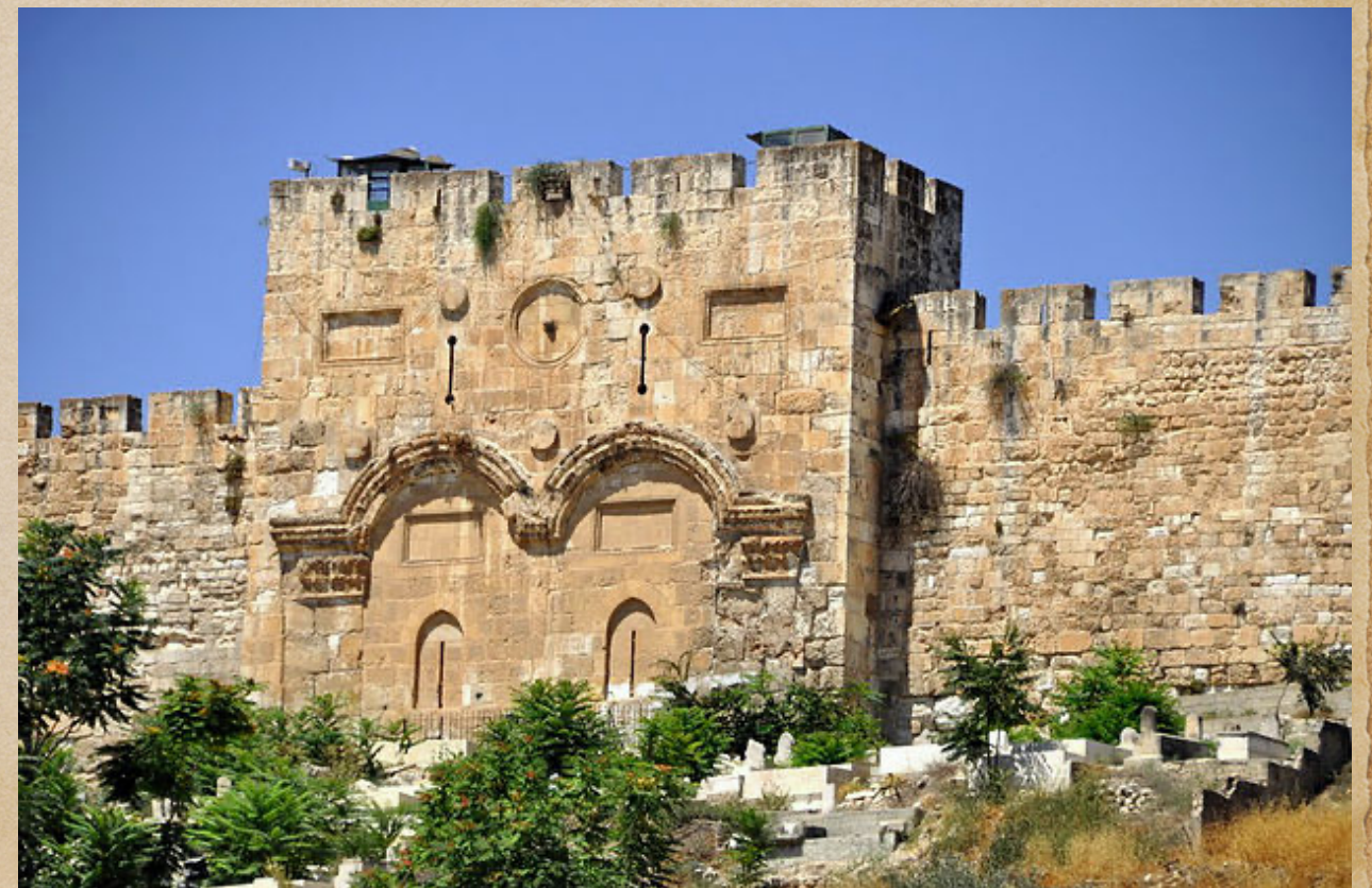
East Gate https://smoothstone.org/through-the-eastern-gate/