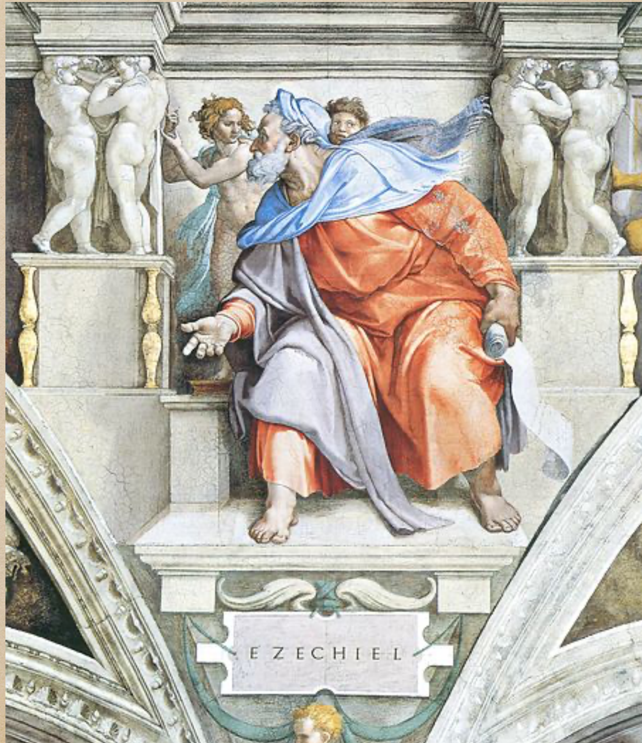
Ezekiel , as depicted by Michelangelo on the Sistine Chapel ceiling