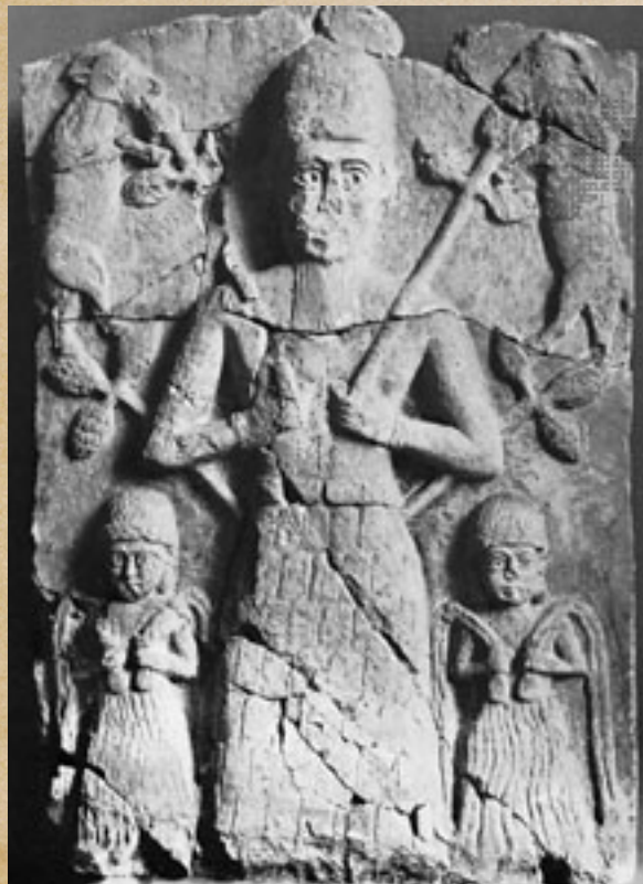
Tammuz, alabaster relief from Ashur, c. 1500 BC; in the Staatliche Museen zu Berlin, Germany